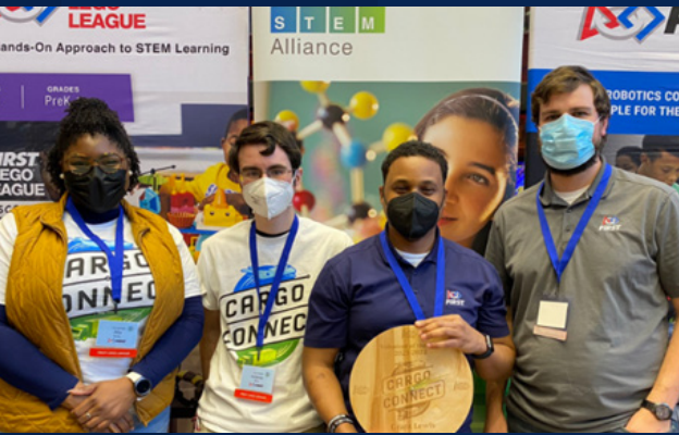
Many employees receive recognition for their support of the FIRST LEGO league and other outreach activities.