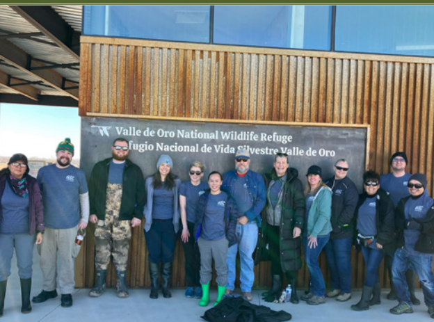
KCNSC New Mexico team members volunteer at the Valle de Oro National Wildlife Refuge

See all of KCNSC's Community Partner Organization in the final pages of this document.