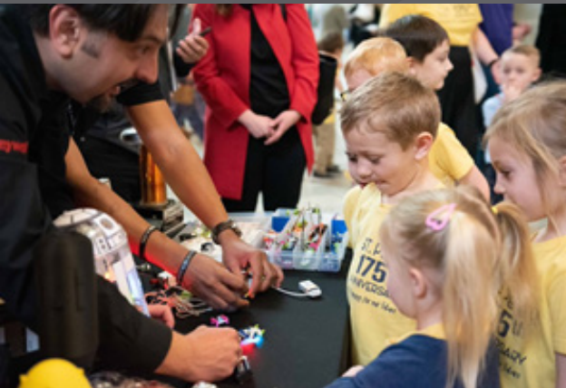
KCNSC mentors teach students about electrical engineering principles during the 2022 STEM Day at the Capitol.